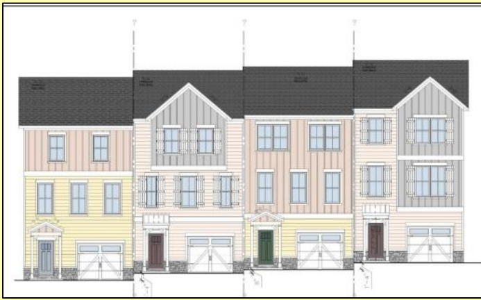
Cherryview Landing Architectural Renderings